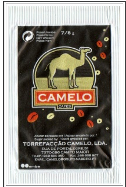
Verso Comum ( 01 e 03 )