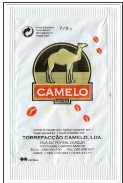
Verso Comum ( 02 e 04 )