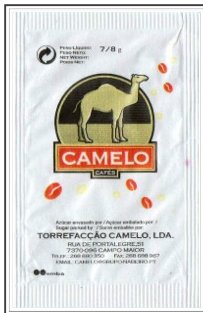
Verso Comum ( 02 e 04 )