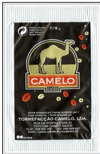
Verso Comum ( 01 e 03 )