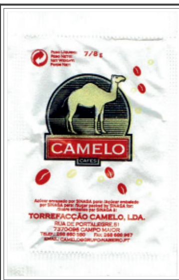
Verso Comum ( 05 a 08 )