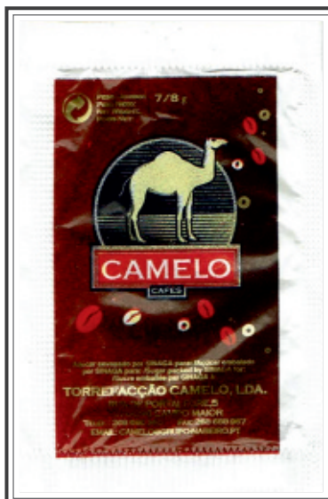
Verso Comum ( 01 a 04 )